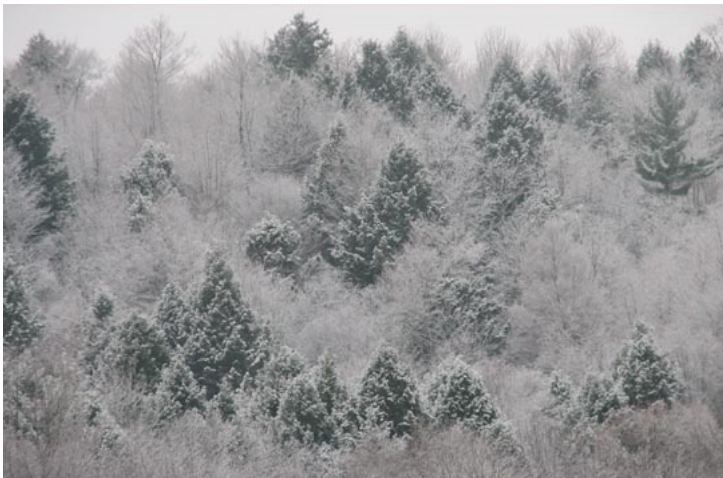
Winter's snow covers the hills above Jiunzan Tendai-ji

❖ Please send your articles, sangha news, artwork and photographs for the February issue of Shingi to fitterer@acmenet.net by January 15.